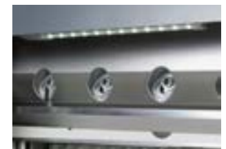
LED cuttingline indicators ensure optimum illumination, even when lighting is poor. The indicator is clearly visible on many materials