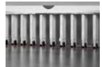
Backgauge rakes with plastic gliders treat the table surface with care