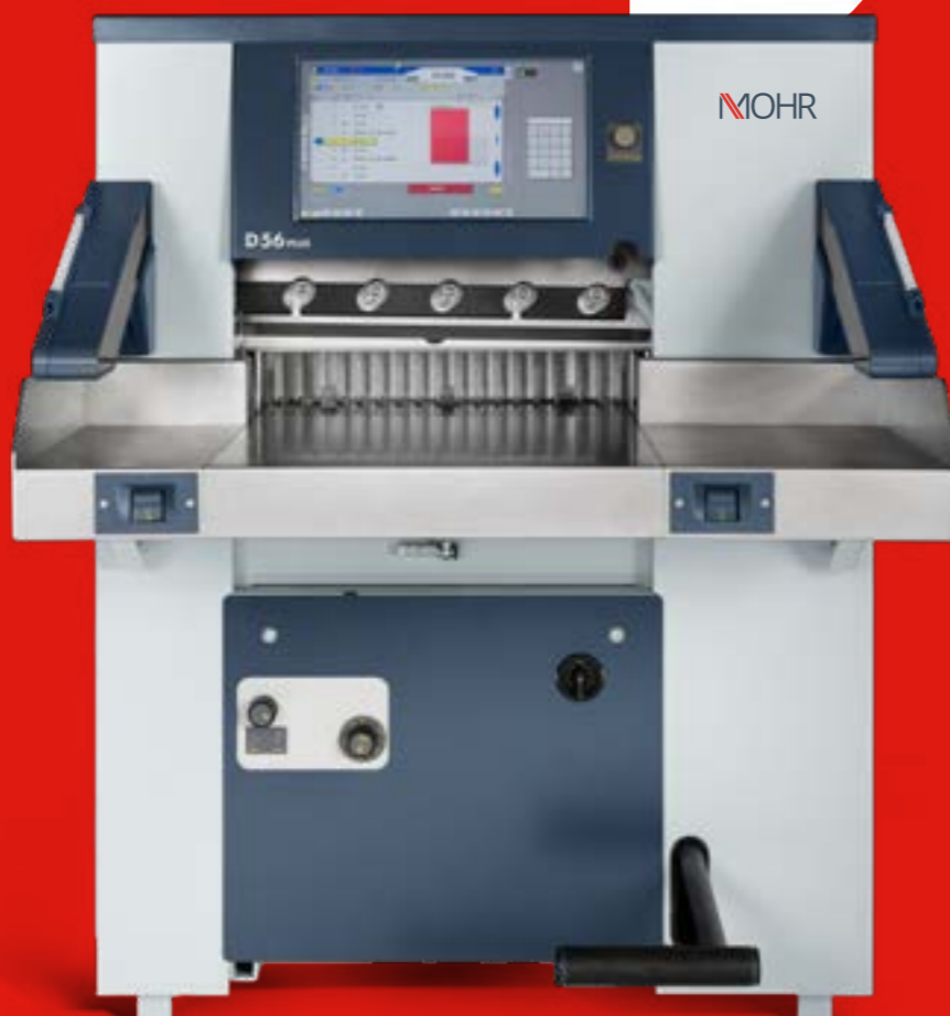
MOHR Cutter D 56 PLUS