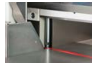
A cutting stick ejector eases and abbreviates the exchange