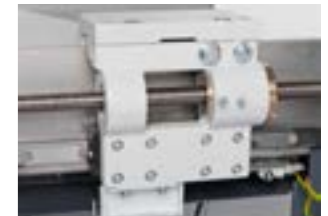
Linear ball bearing – maintenance-free and extremely precise